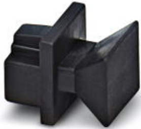
Dust protection caps for RJ45 socket

Please be informed that the data shown in this PDF Document is generated from our Online Catalog. Please find the complete data in the user's documentation. Our General Terms of Use for Downloads are valid ( http://phoenixcontact.com/download )