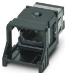
Fiber optic coupling, degree of protection: IP20, connection method: Coupling, cable outlet: straight

Please be informed that the data shown in this PDF Document is generated from our Online Catalog. Please find the complete data in the user's documentation. Our General Terms of Use for Downloads are valid ( http://phoenixcontact.com/download )