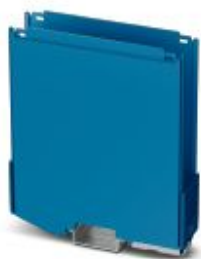
DIN rail housing, Lower housing part with metal foot catch, Level 1: with vents, width: 25 mm, cross connection: DIN rail connector (optional), number of positions cross connector: 8, color: blue (5015)

Please be informed that the data shown in this PDF Document is generated from our Online Catalog. Please find the complete data in the user's documentation. Our General Terms of Use for Downloads are valid ( http://phoenixcontact.com/download )